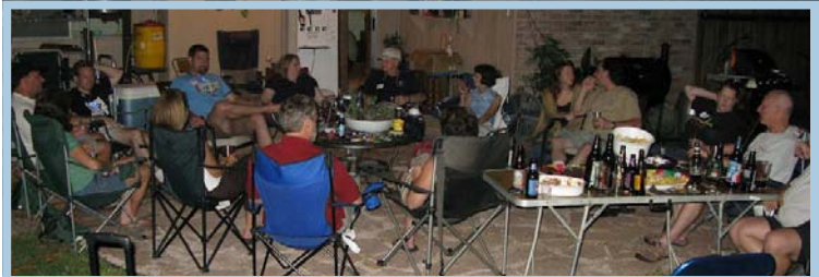
Wimpy ass brown ales, amber ales and pale ales made the rounds during the old regime's last (and final?) BOM presentation. Yes, it's late in the evening when this photo was taken, and everyone is still stone cold sober. The MOT is taking pictures in dim light that are in focus, for crying out loud!