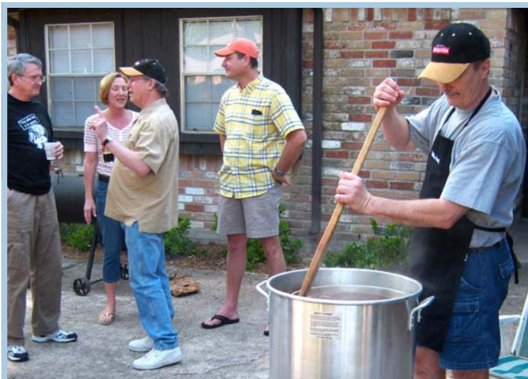
Like it was the launch of the next generation PlayStation or something, comrades started queuing up to get crawfish long before it was time to eat.