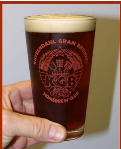
Buy KGB Pint glasses!