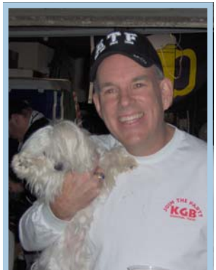
Always schmoozing up the bitches, RC Tim cops a feel from Tasha, the ever-obliging brew-dog.