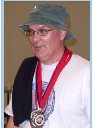
The new and improved Czar Ed shown before he got the hat upgrade.